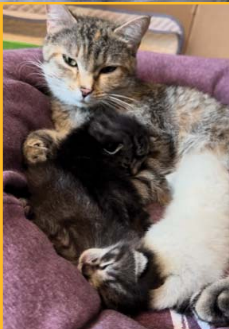
Denali, Kilimanjaro, and Everest